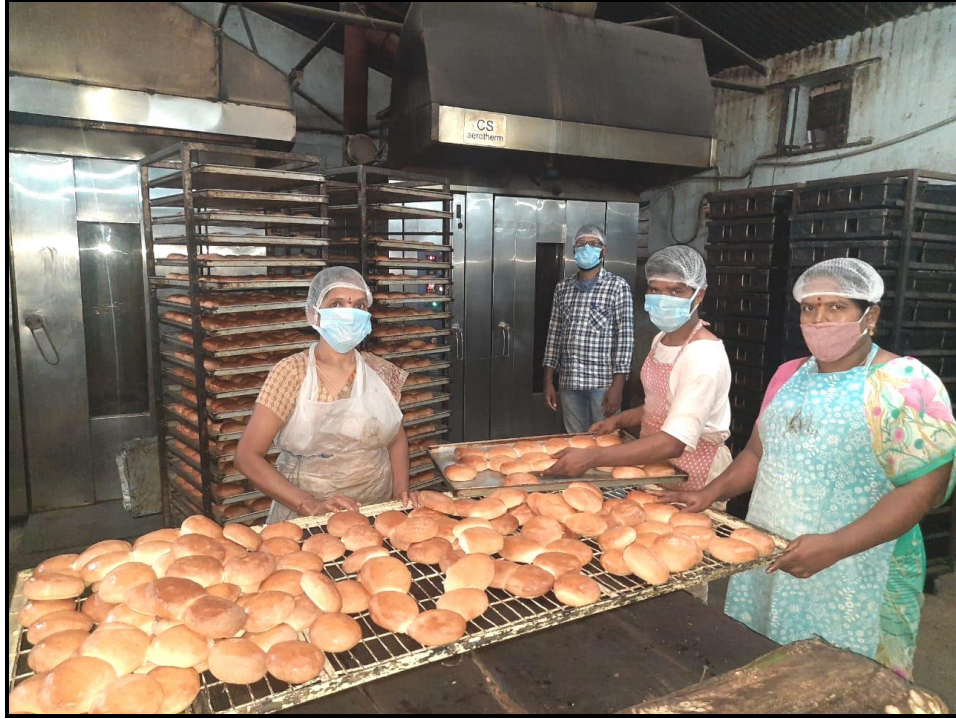
Our students observing the process of bread making in Jagathi foods in Warangal