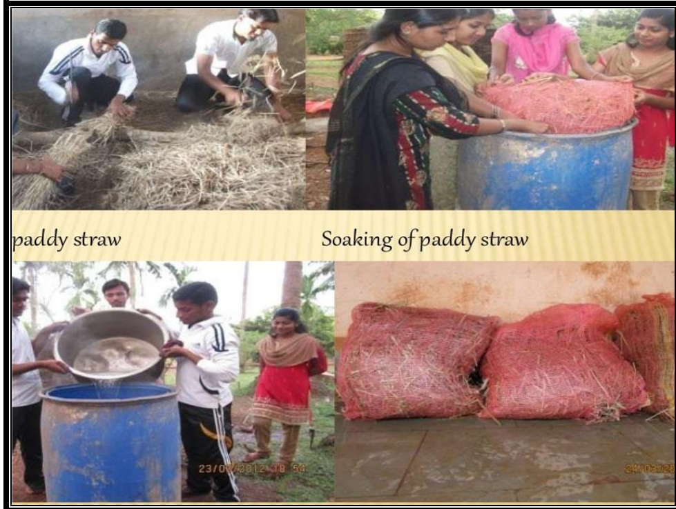
Our students cultivating the Mushrooms